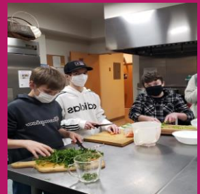
Cutting some veggies